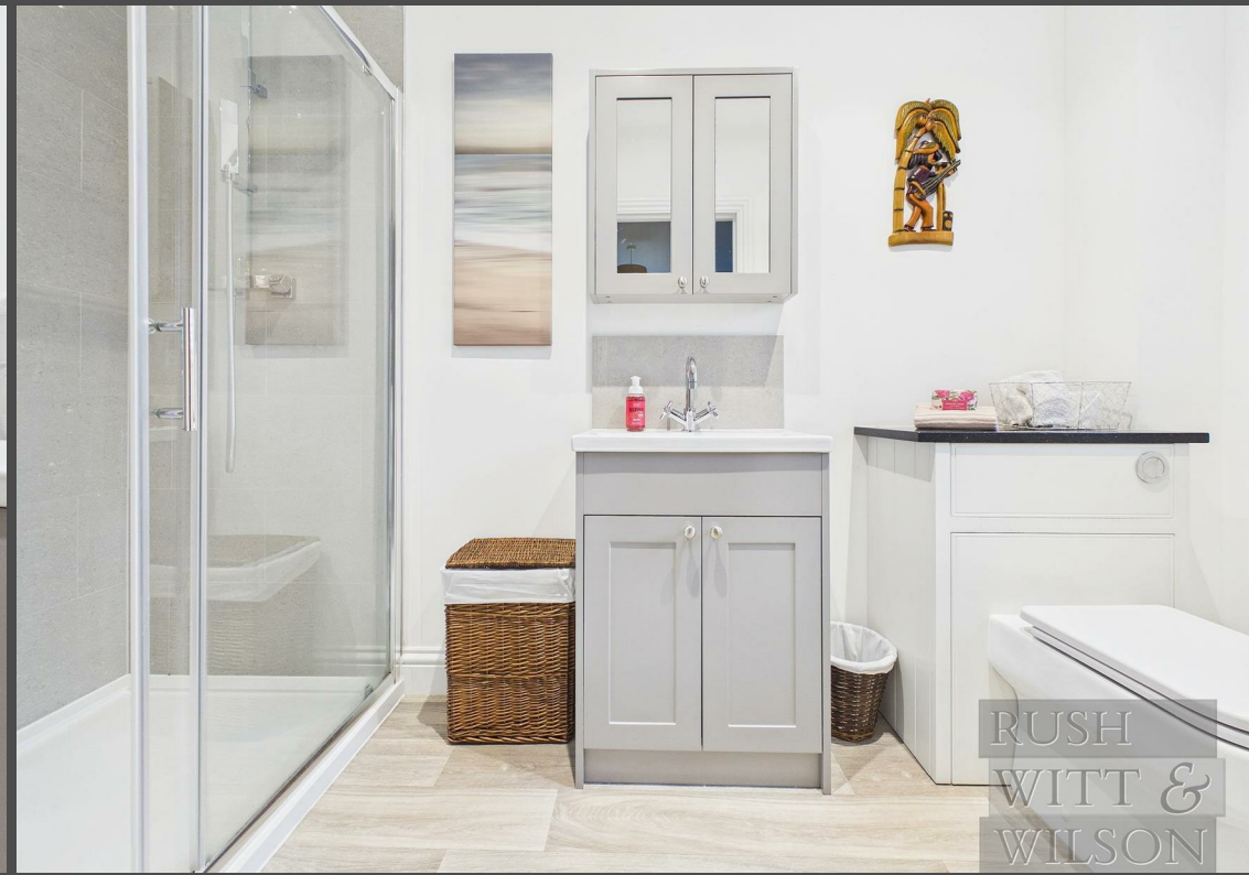
RUSH WITT & WILSON